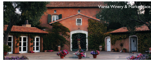
Viansa Winery & Marketplace

Touring & Tasting www.touringandtasting.com