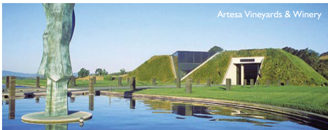
Artesa Vineyards & Winery